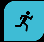
PHYSICAL EDUCATION 09