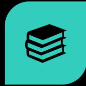
SOCIAL STUDIES 09