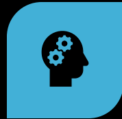
LANGUAGE OR SKILLS OR ELECTIVE