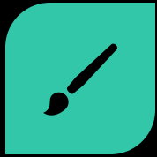
LANGUAGE ARTS 09